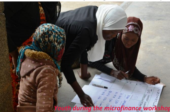
Youth during the microfinance workshop

March saw the creation of the MASYAP youth microfinance scheme. 26 girls received two days' training before being disbursed a loan of MWK 15,000 (around $20). MASYAP will look to roll out the scheme to other members if this pilot goes successfully.