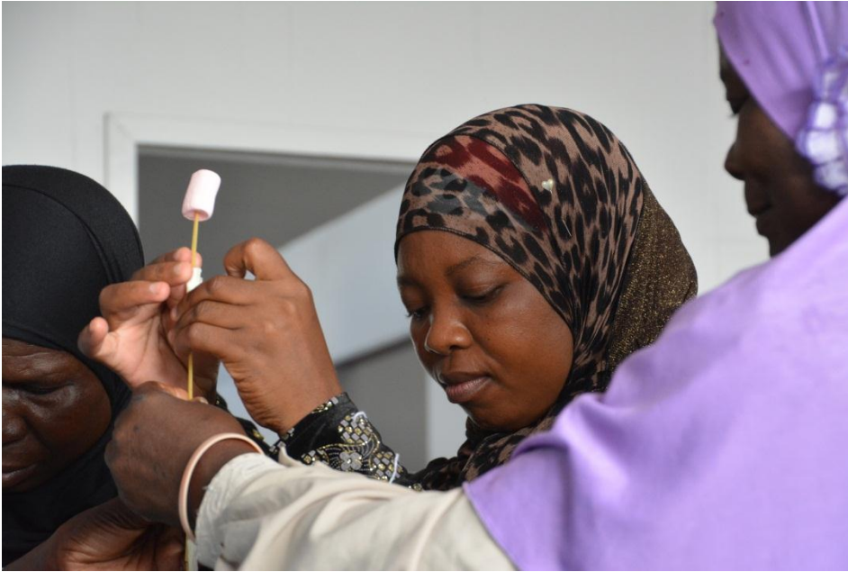
Working as a team during the entrepreneurship workshop by World Appeal